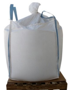
2000 lb Bags